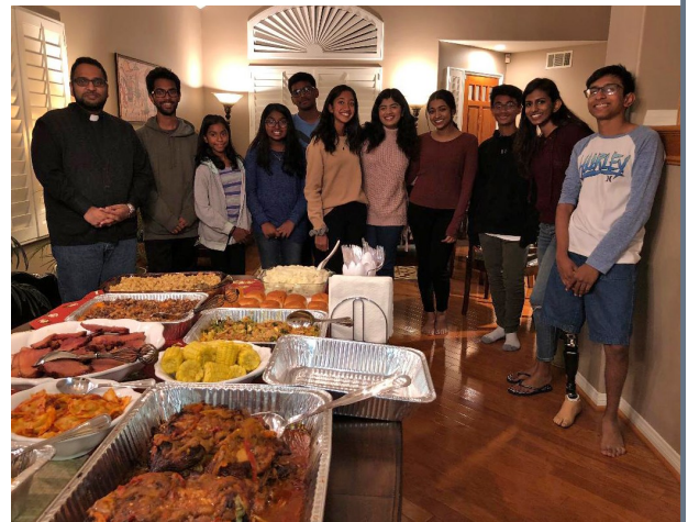
Youth Fellowship Thanksgiving Potluck

This November, Horeb collected 26 gift-filled shoeboxes to donate to Samaritan's Purse Operation Christmas Child. Members from both Horeb MTCLA and Garden Grove United Methodist Church also collected a whole minivan full of blankets and jackets which were donated to OC Rescue Mission. A big thank you to all for your generosity.