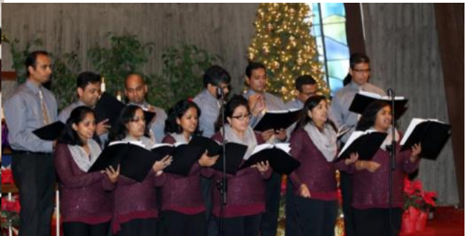
1. Volunteering at Voice of Refugees Dinner 2. Sunday School Toy Drive 3. Youth Fellowship performs at Carol Service 4. House-to-House Carol Rounds 5. Choir performs at Carol Service