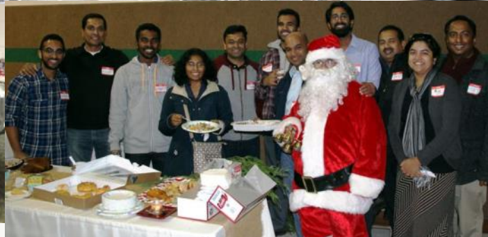
1. Sunday School Toy Drive Drop off at Colette's Children Home. Over 65 toys, worth approximately $1000, were collected by Horeb Members 2. Horeb volunteers at the Voice Of Refugees Christmas Dinner